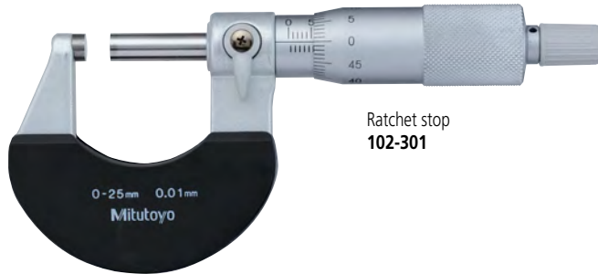
Ratchet stop 102-301